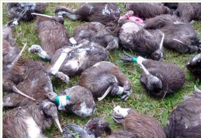
Kiwi that have been killed by dogs